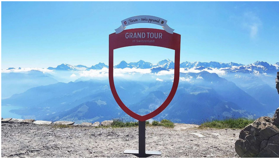
Niesenbahn AG, Interlaken Tourismus - web@interlaktourism.ch

Point of view Disability Access summer winter