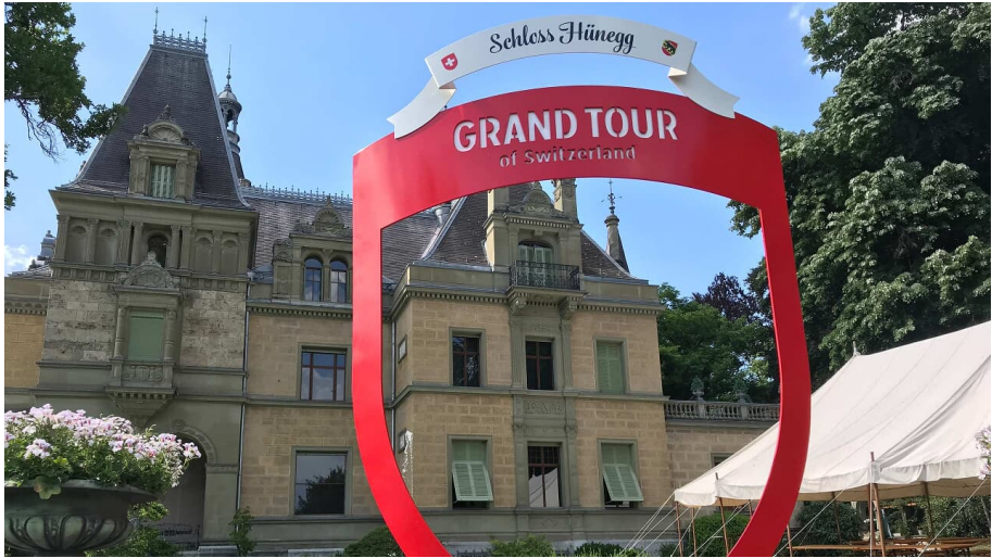
Schloss Hünegg