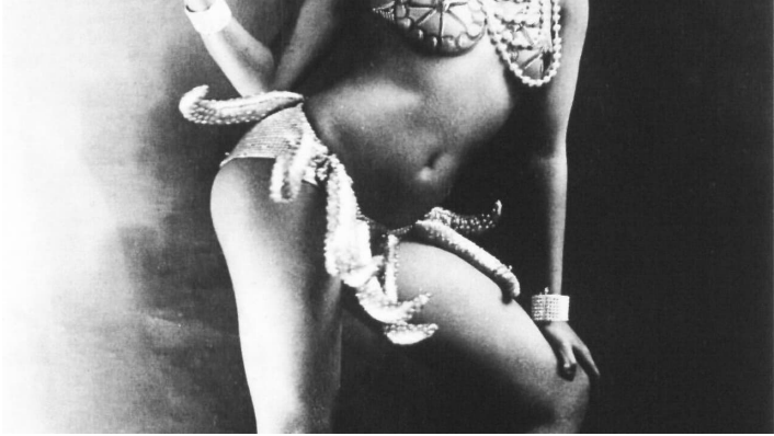
Deutsches Tanzarchiv Köln Simon Rupieper