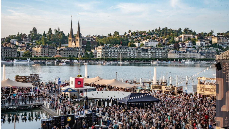
Lucerne Live 2023