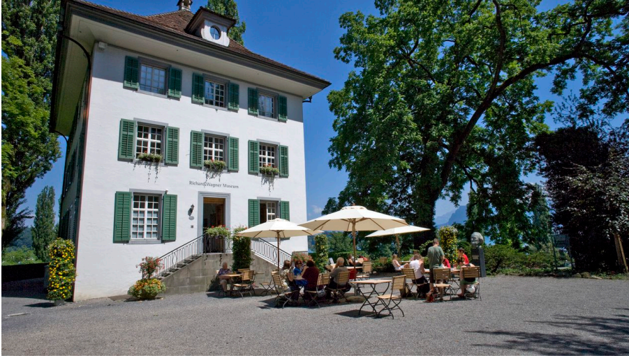
Richard Wagner Museum