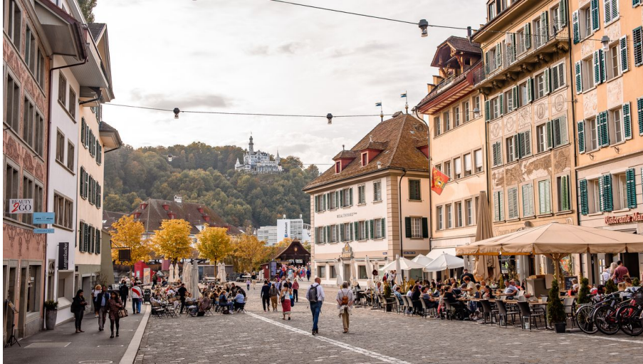
Mühleplatz - © Luzern Tourismus, Tanja Müller

Much of the walking takes place conveniently in the car-free Old Town, whose picturesque squares are peppered with historic, fresco-adorned houses.