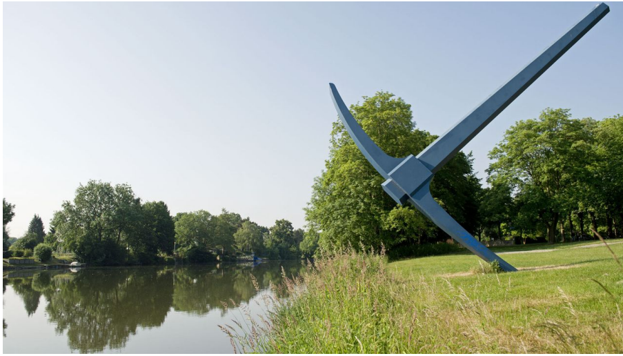
Stadt Kassel; Foto: Nils Klingner

On the banks of the Fulda, the work of art "Spitzhacke" by Claes Oldenburg, installed for documenta 7, towers imposingly.