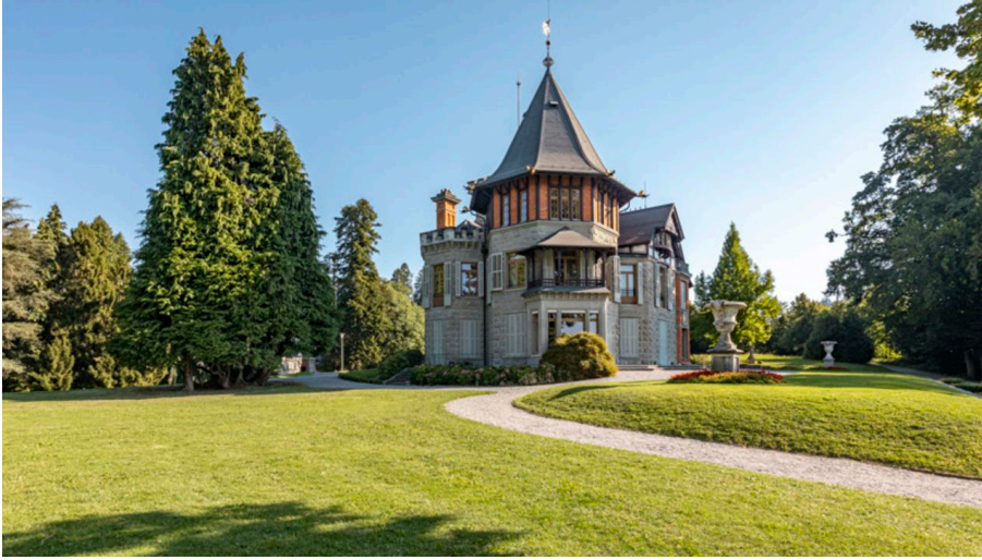
Dreilinden Park (Konsipark)