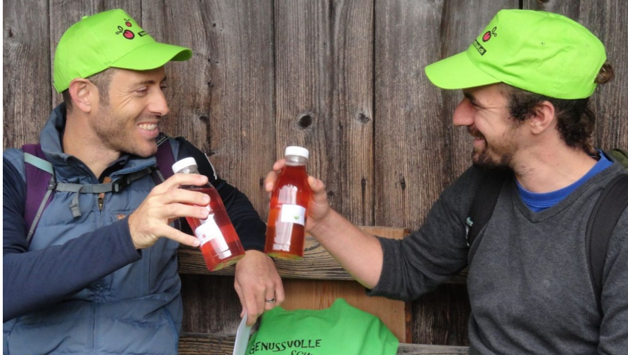
Seetal Tourismus, FoodTrail