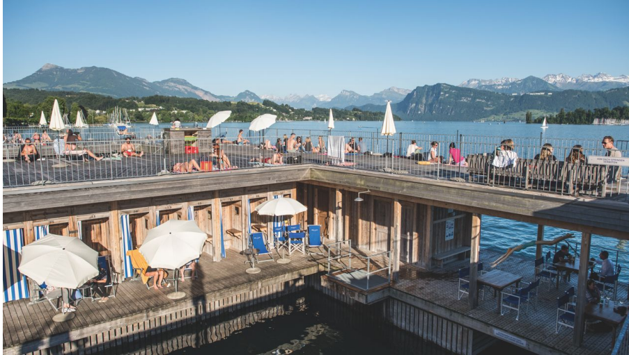
Lakeside resort Lucerne