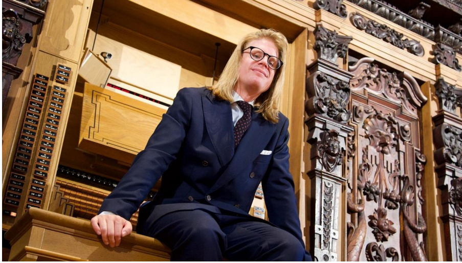
Organ Festival Lucerne