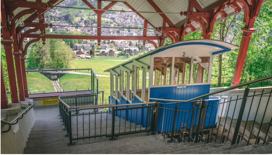
Sonnenberg Bahn