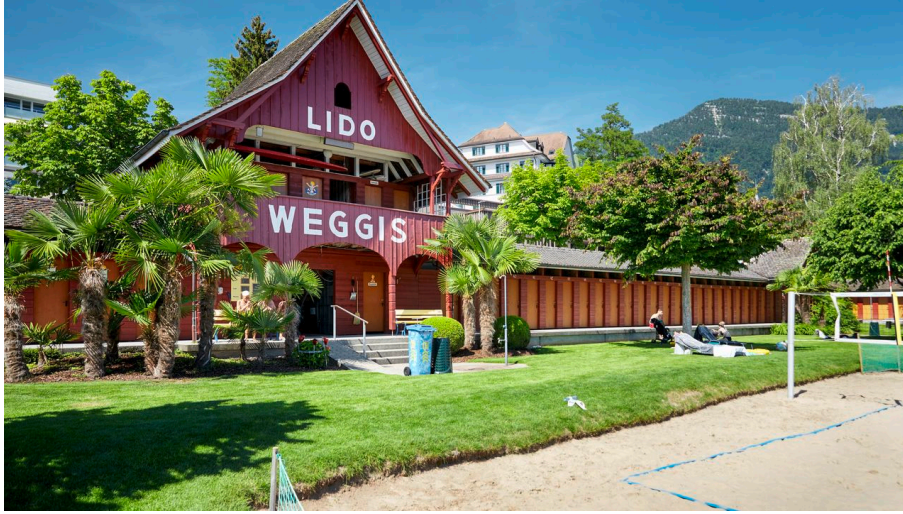
Lido indoor swimming pool Weggis