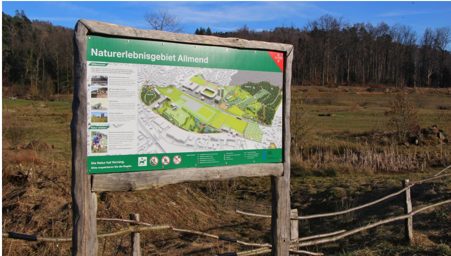
Nature recreation area Allmend