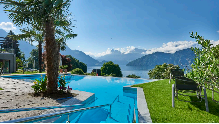
Spa Vitalis Alexander-Gerbi Hotels