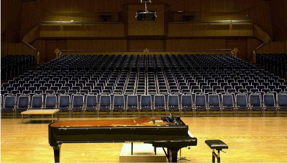
hr Sendesaal