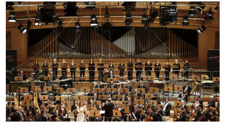
cresc Abschlusskonzert hr Sendesaal