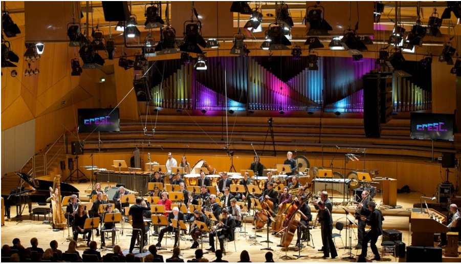
cresc Eröffnung hr Sendesaal