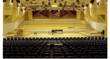
hr-Sendesaal - © hr, Urban Kirchberg