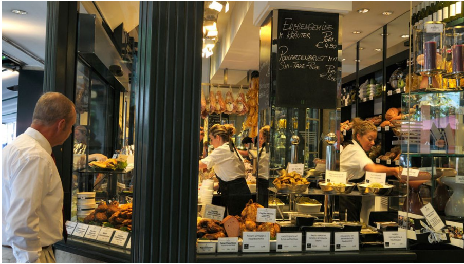
Freßgass Geschäft