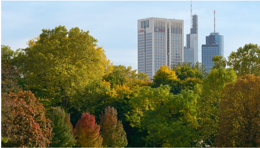
Grüneburgpark grün