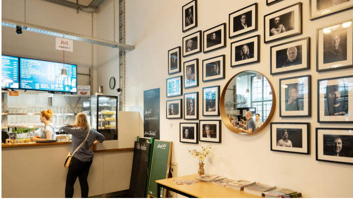
Frankfurt_Käs_1064850_© #visitfrankfurt_plazy_Isabela_Pacini.jpg