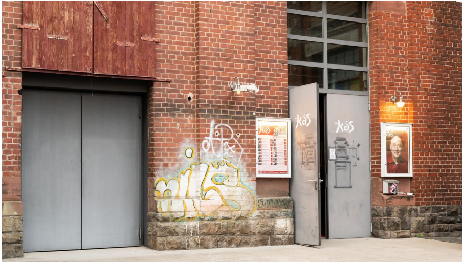
Frankfurt_Käs_1064840_©#visitfrankfurt_Isabela_Pacini.jpg - © #visitfrankfurt_plazy_Isabela_Pacini