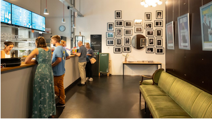
Frankfurt_Käs_1064860_© #visitfrankfurt_plazy_Isabela_Pacini.jpg