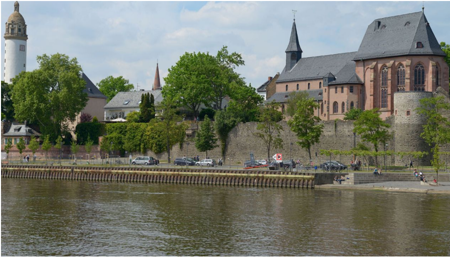
Justinuskirche Höchst