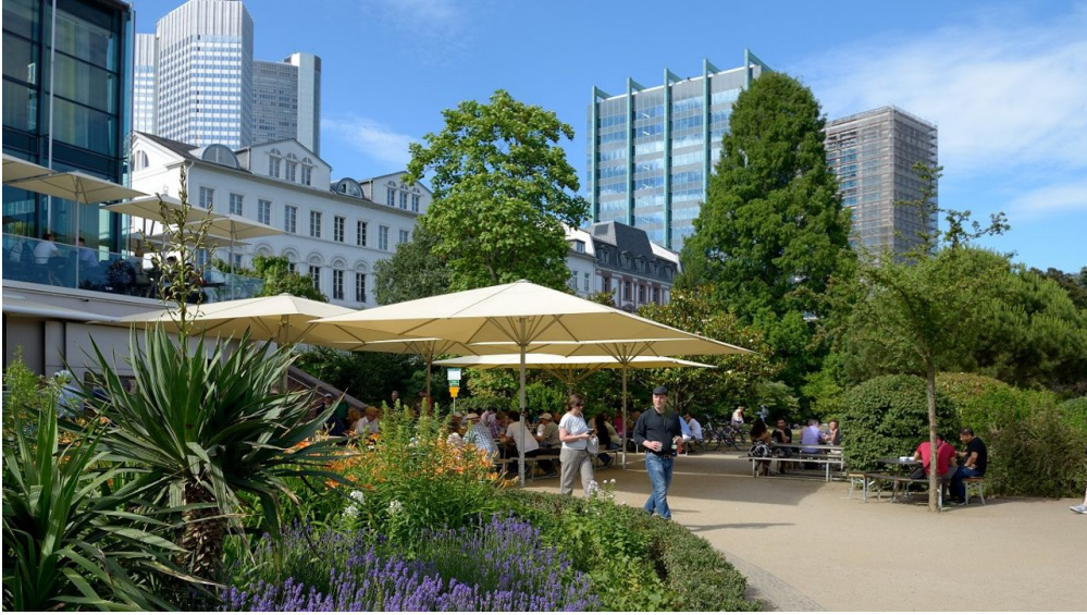
Nizza visitfrankfurt Holger Ullmann DSC 9042x - © #visitfrankfurt, Holger Ullmann