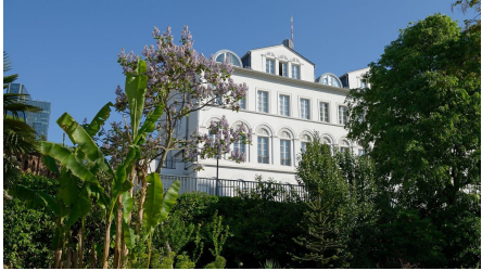
Nizza visitfrankfurt Holger Ullmann DSC 4867x