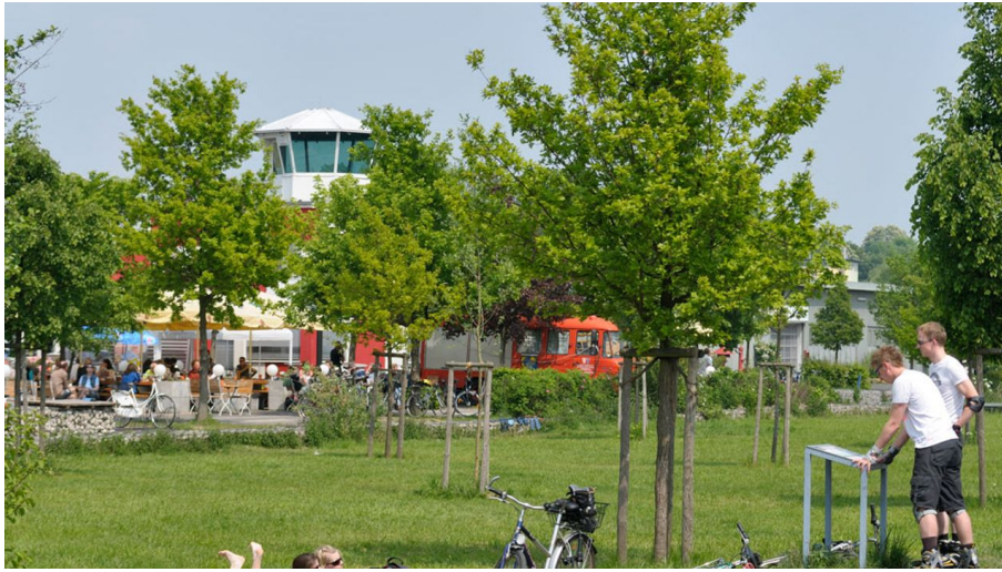
Alter Flugplatz Bonames