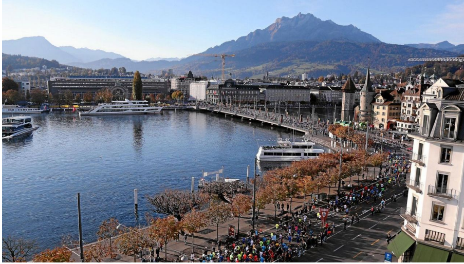
SwissCityMarathon Lucerne