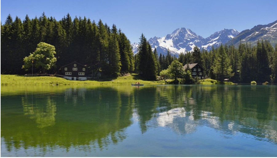
Lake Arni in Intschi - © Luzern Tourismus

Lake Arni is the perfect place for setting off on wonderful hikes, mountain tours and family outings.