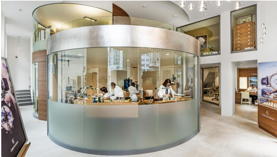
House of Chronoswiss