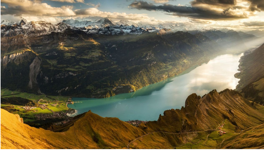
View of Lake Brienz