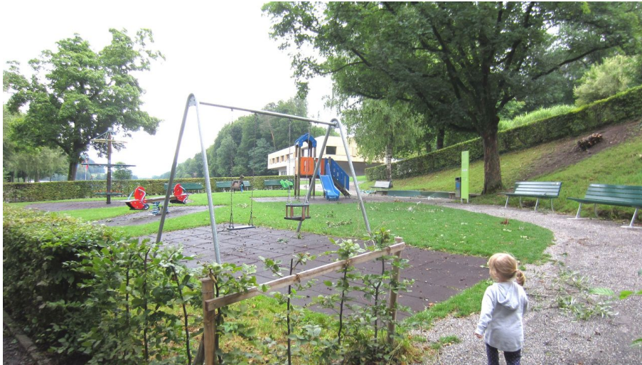
Eveline Kramis (Luzern Tourismus AG), Region Luzern-Vierwaldstättersee

Beautifully situated playground in the Rotsee nature reserve, right next to the lake and the rowing centre. A public toilet is located at the rowing centre.