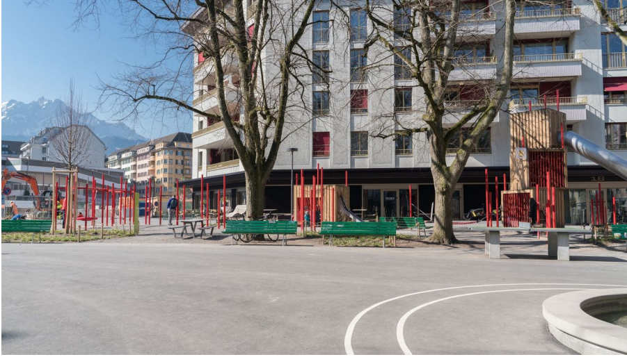
Laila Bosco, Luzern Tourismus AG