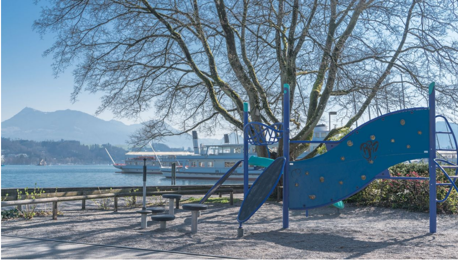
Laila Bosco, Luzern Tourismus AG