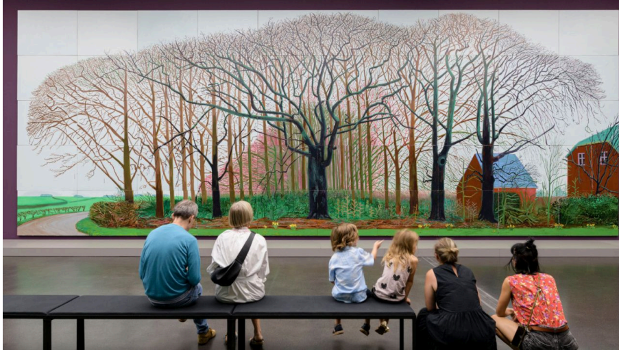
Museum of Art Lucerne