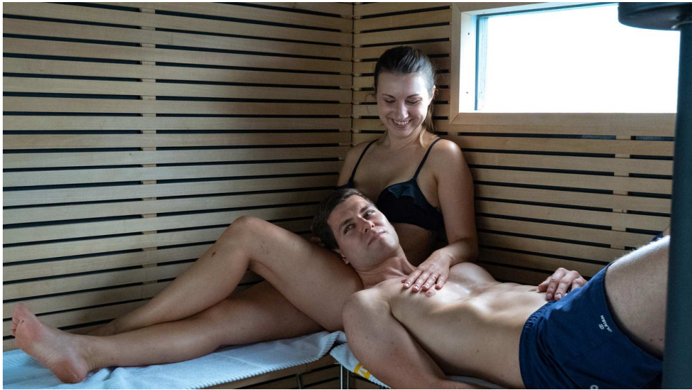
Saunaboot Thunersee (Projektreich GmbH, Brenzikofen)