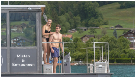
Saunaboot Thunersee (Projektreich GmbH, Brenzikofen)