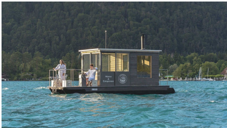
Saunaboot Thunersee (Projektreich GmbH, Brenzikofen)