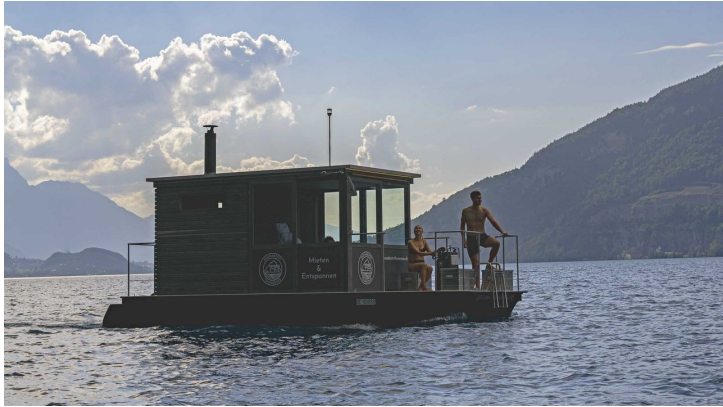
Saunaboot Thunersee (Projektreich GmbH, Brenzikofen)