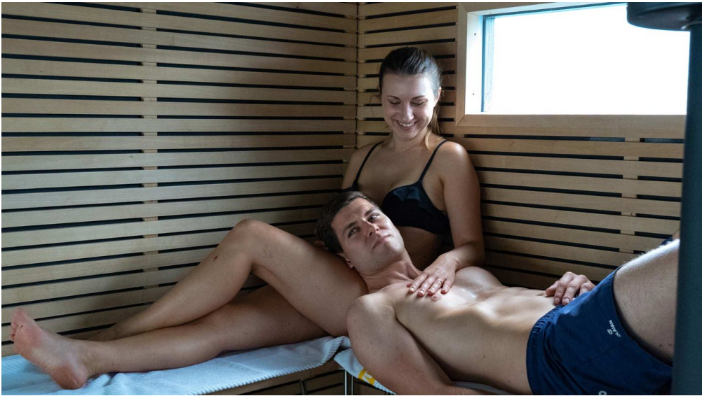
Saunaboot Thunersee (Projektreich GmbH, Brenzikofen)