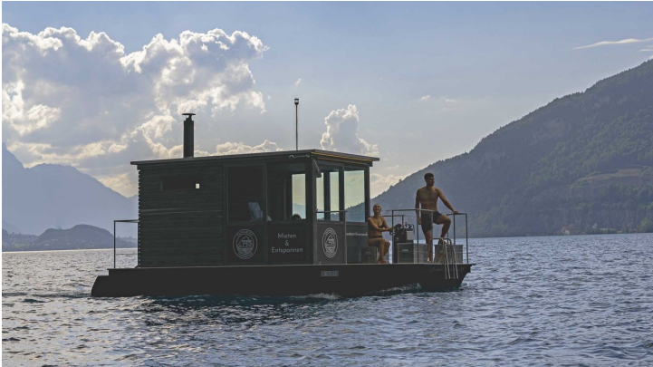
Saunaboot Thunersee (Projektreich GmbH, Brenzikofen)