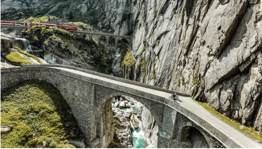
Nico Schärer | Luzern Tourismus