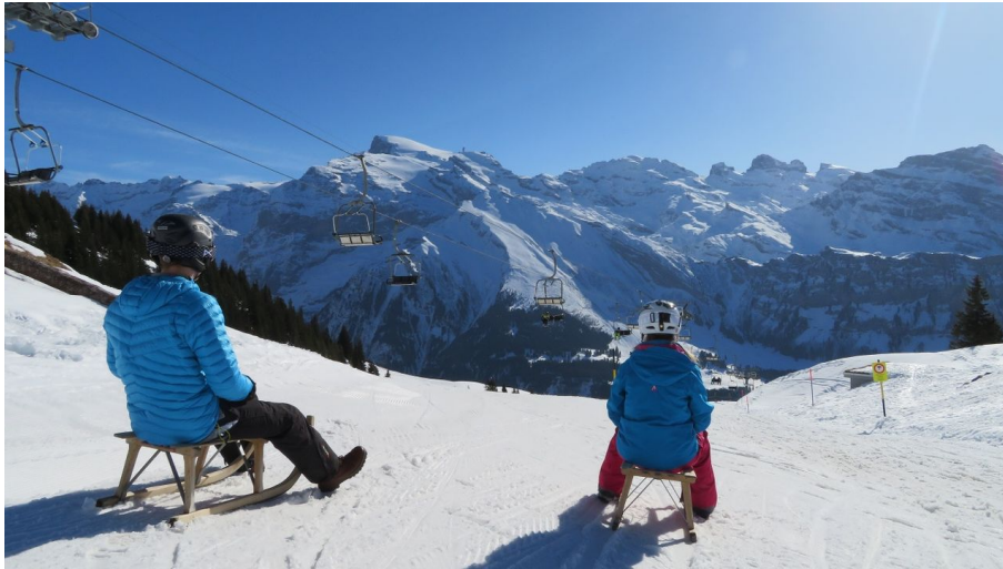
Engelberg - Titlis Tourismus, Engelberg-Titlis Tourismus