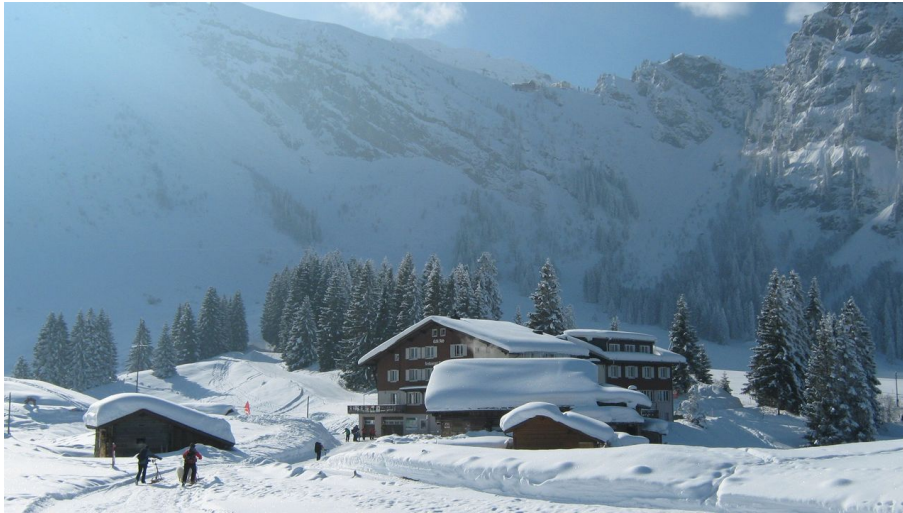
Engelberg - Titlis Tourismus, Engelberg-Titlis Tourismus